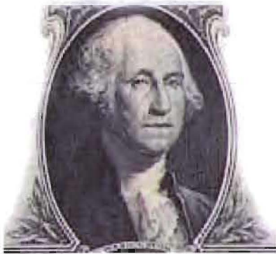
GEORGE WASHINGTON U.S. ONE DOLLAR BILL