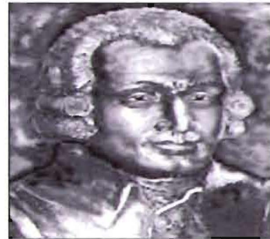
ADAM SMITH ECONOMIST AND PHILOPHER 1723-1790